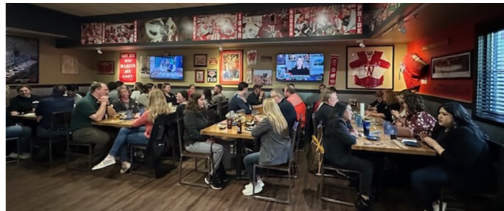
Right: Attendees at the Customer Appreciation Dinner on Wednesday night.