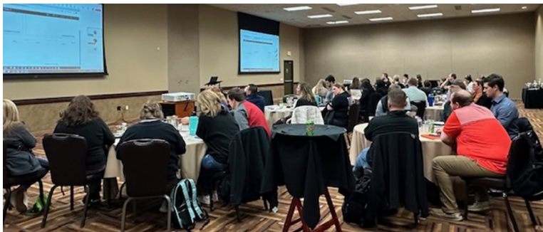
Left: Attendees in the Wednesday session.

"It was nice to see current customers making prospects feel very welcomed! Some were helping others with terminology and things that current customers already understand, that was awesome to see."